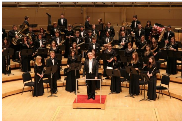
The Symphonic Band performed in March 2013 in Orchestra Hall in Chicago.