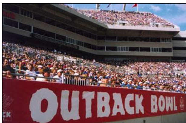
The Marching Shoremen performed in the half-time at the Outback Bowl in Tampa on January 1 st , 2015.

NEXT YEAR-Russell Athletic Bowl in Orlando, FL!!!