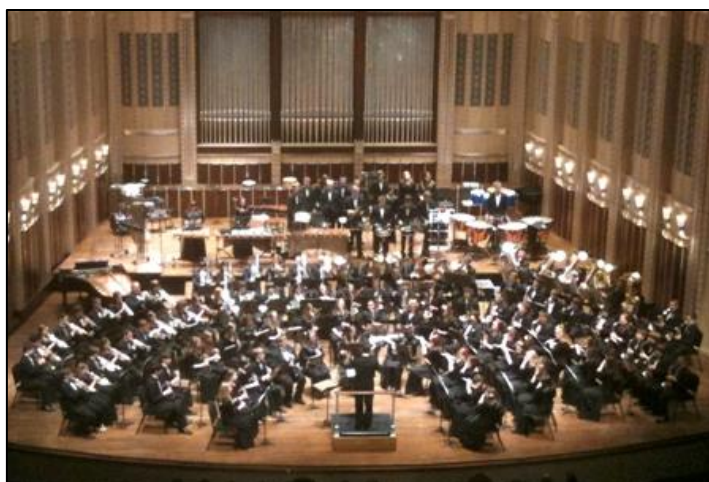
The Symphonic and Concert Bands performed at Severance Hall January 2011.